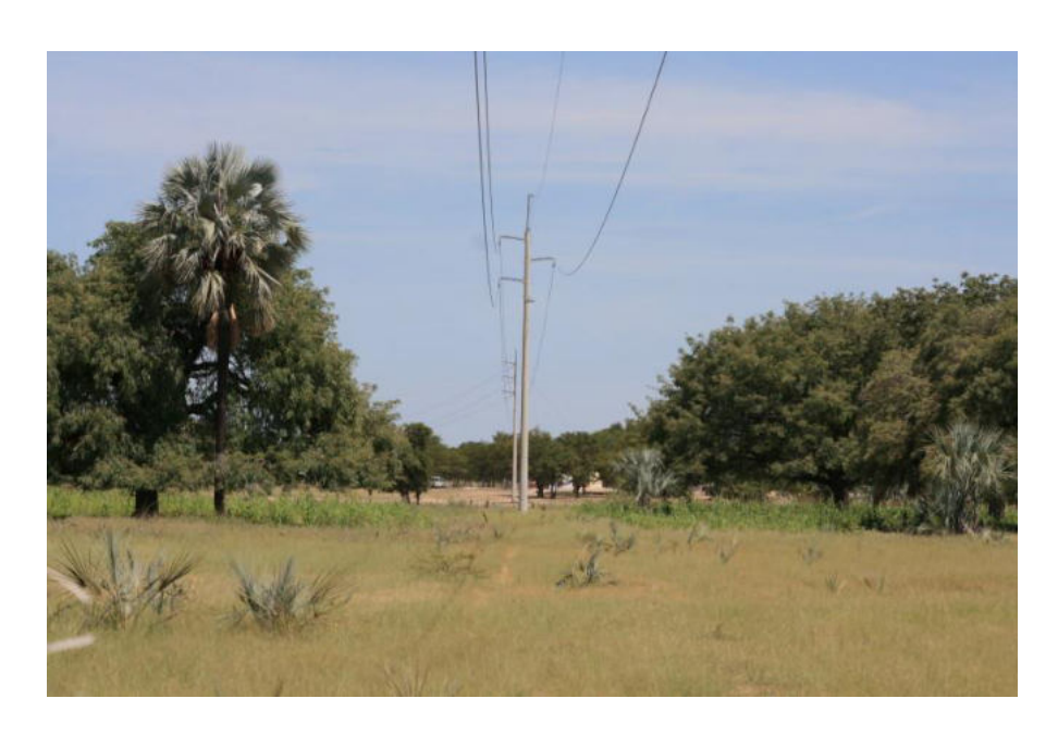
Figure 3. The line transverses through some Mahangu fields and are viewed as important and sensitive areas.