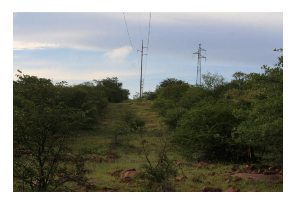
Figure 3. Rocky terrain along the route – Ruacana area.