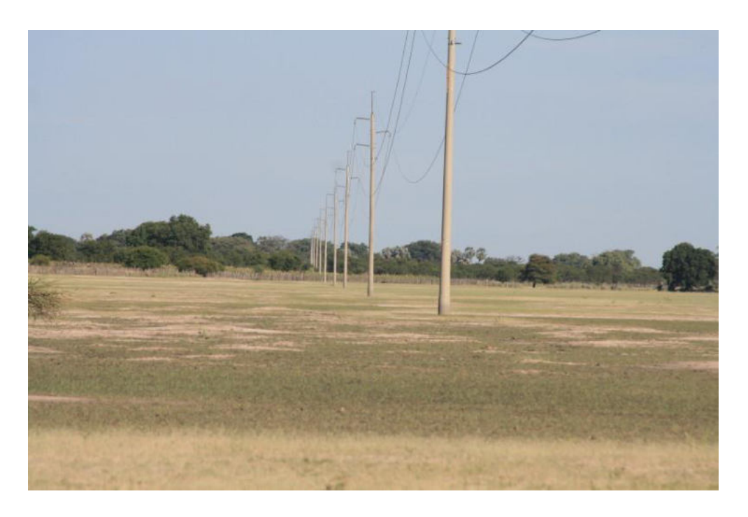
Figure 2. Pan (Oshana) areas are viewed as important habitat.

The impact of most common line activities such as inspections and general maintenance activities would be site specific and have a relatively small environmental "footprint" and is not expected to have a major impact on the environment.