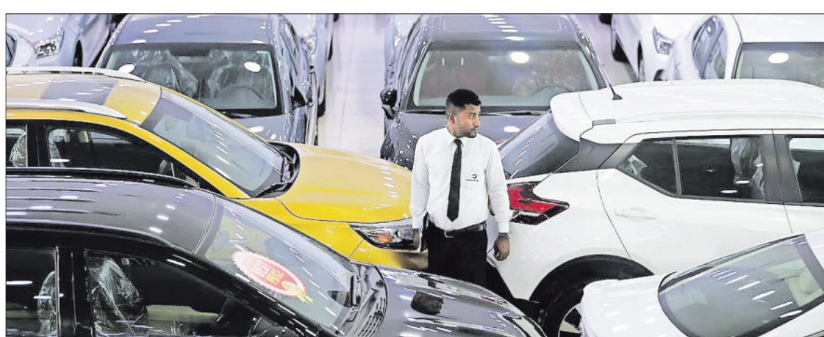
Toyota replaced Volkswagen as the most popular passenger brand.

The passenger vehicles category accelerated by 13.7% year-on-year and recorded a contraction of 13.1% month-on-month, with 357 units