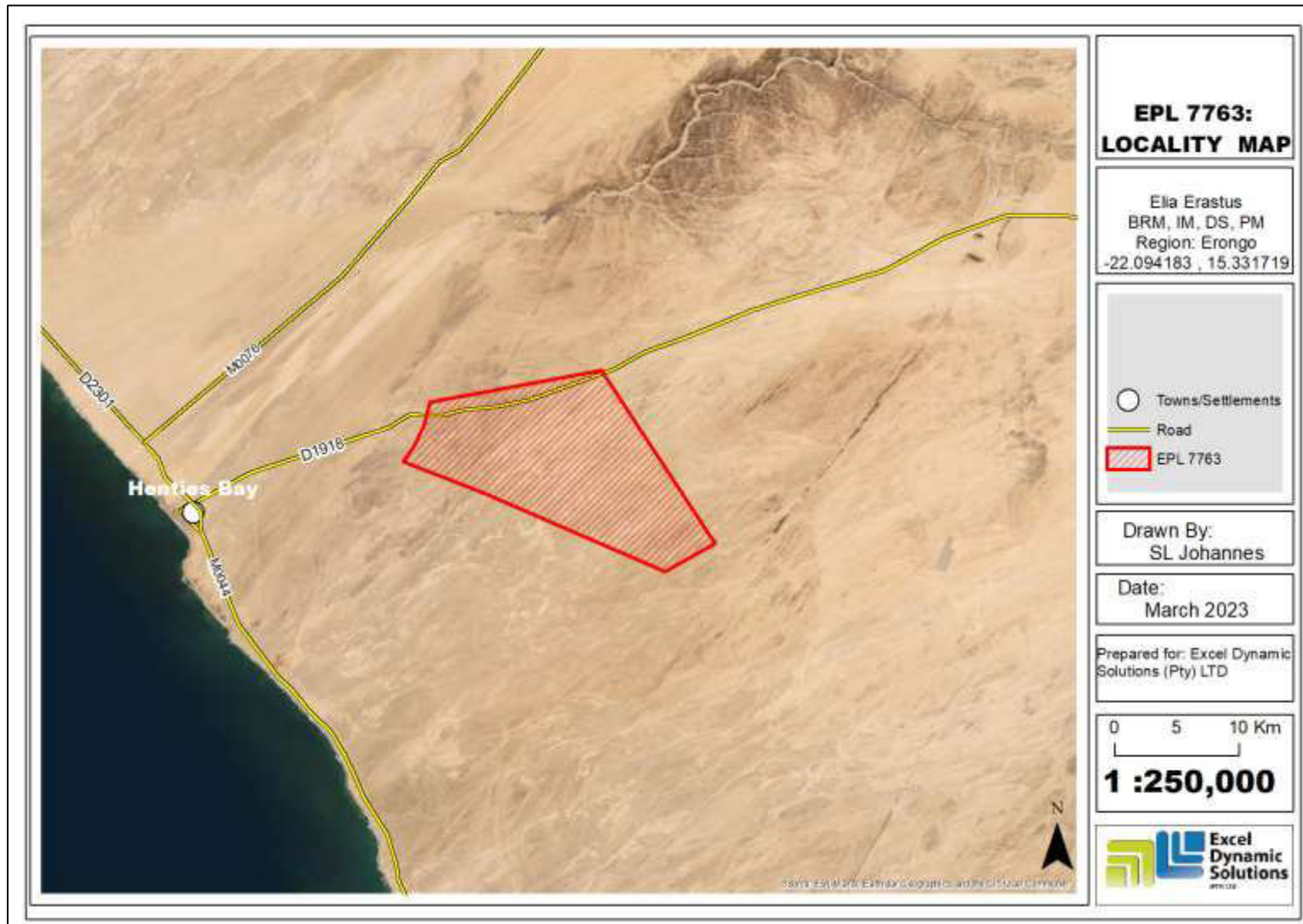
Figure 1: Location of EPL 7763