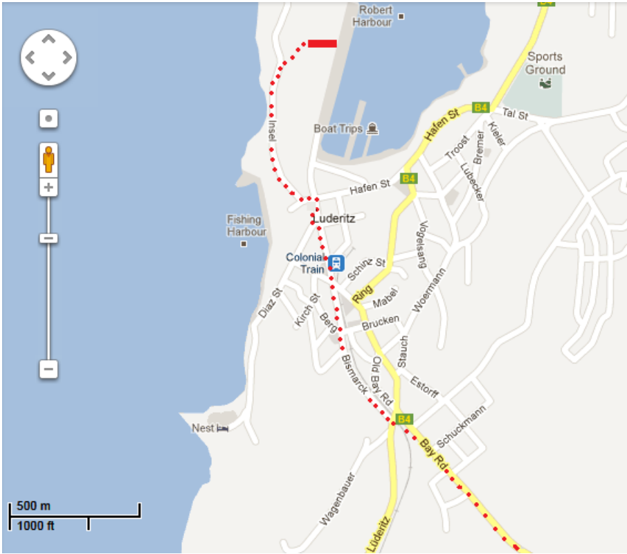
Figure 1: Proposed route through Lüderitz to storage shed (from EIA report)