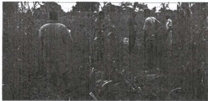
Time to reap... Conservancy agriculture needs to be practised for Namibia to start reaping benefits.

"Policymakers and government officials have for years maintained that agriculture possesses the potential to significantly contribute to national wealth, job creation, and food security. Namibia's leaders have also placed significant emphasis on sustainable natural resource management and conservation. This compels government and stakeholders in the agricultural sector to consider and