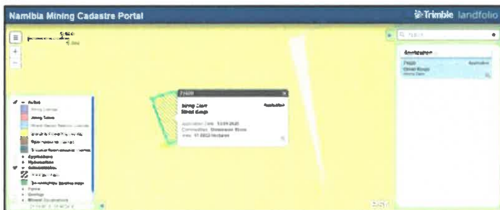
Locality map of mining claim 71620 (Shown above by the blue quadrant) for mining dimension stones.

In line with Namibia's Environmental Management Act (No. 7 of 2007) and EIA regulations (GN 30 of 6 February 2012), all I&APs are hereby invited to register and submit their comments, concerns or questions in writing via Email: askheec@gmail.com ; Mobile: 081 2050902 on or before Monday 24 th February 2020 .