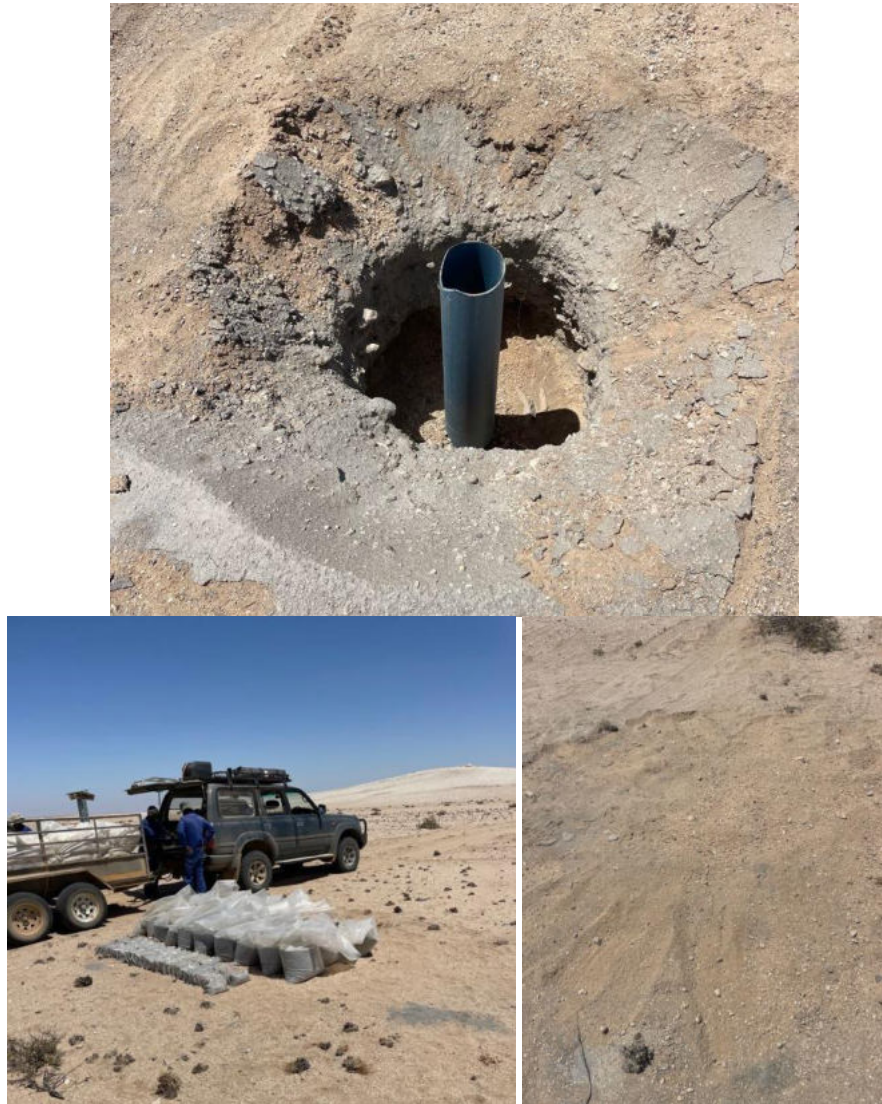
Figure 2 - Rehabilitation of RC holes

The proponent continually ensures that all impacts caused by them during exploration activities are rehabilitated (Figure 2).