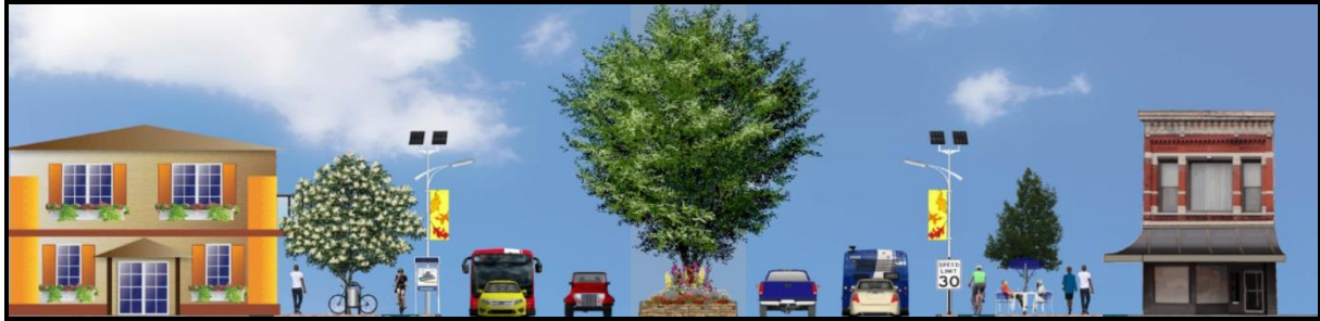
Figure 3: Potential street development

The proposed development thus further aims to provide economic opportunities such as street-café's and street trading spaces from which the town can benefit. See the Figure 4 below for examples of potential on street trading and business opportunities.