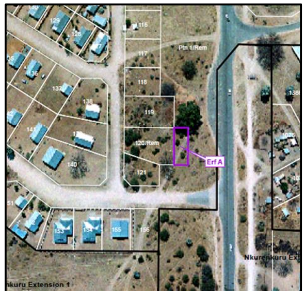
Figure 2: Aerial photo of Erf 120, Nkurenkuru

The newly created street is proposed to be utilised for on-street parking and beautification of the area. Figure 3 below illustrates potential development of main street to provide interactive, vibrant and safe spaces for use by pedestrians and vehicle users.