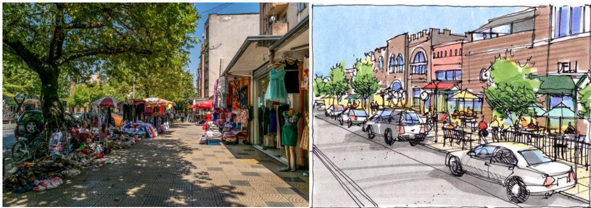
Figure 4: Potential on-street trading and business opportunities

The proposed development thus further aims to provide economic opportunities such as street-café's and street trading spaces from which the town can benefit. See the Figure 4 below for examples of potential on street trading and business opportunities.