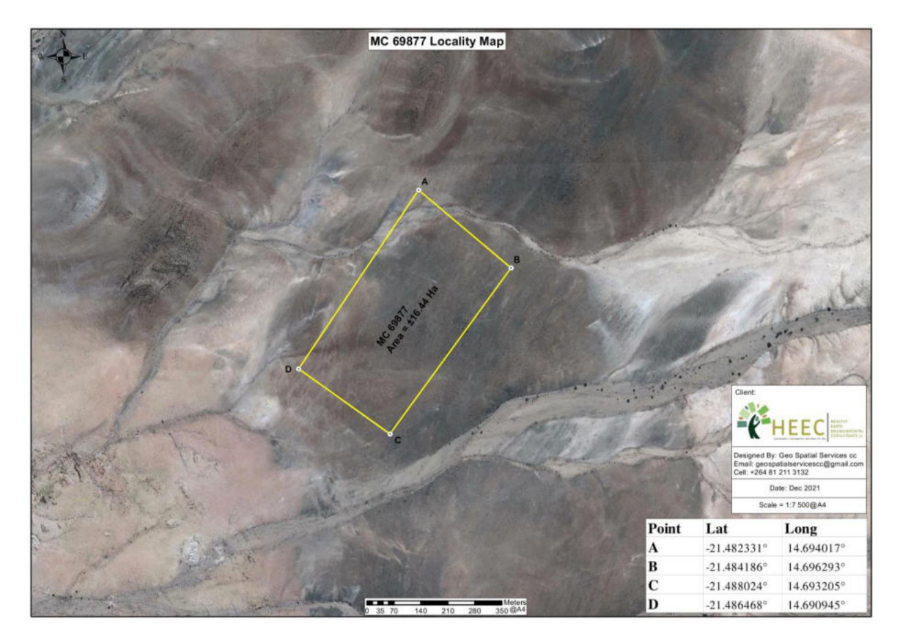
Figure 2: Locality map of mining claim 69877, Uis District, Erongo Region (HEEC, 2022)