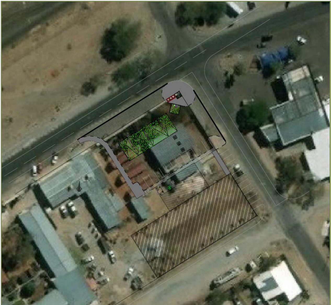
Figure 2. Proposed new site layout plan

The upgrade and fuel storage alterations at the facility will be constructed and operated according to relevant SANS standards (or better), with special emphasis on SANS 10089:1999, SANS 100131:1977, SANS 100131:1979, SANS 100131:1982, SANS 100131:1999.