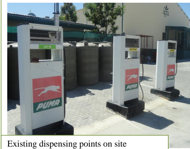
Existing dispensing points on site