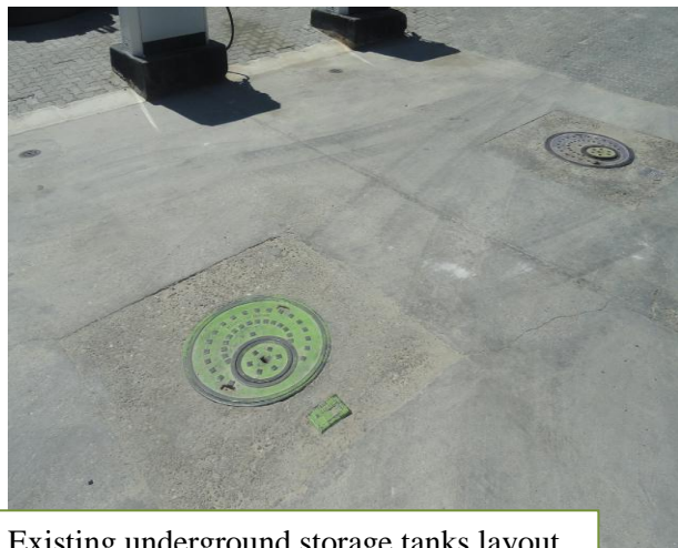
Existing underground storage tanks layout