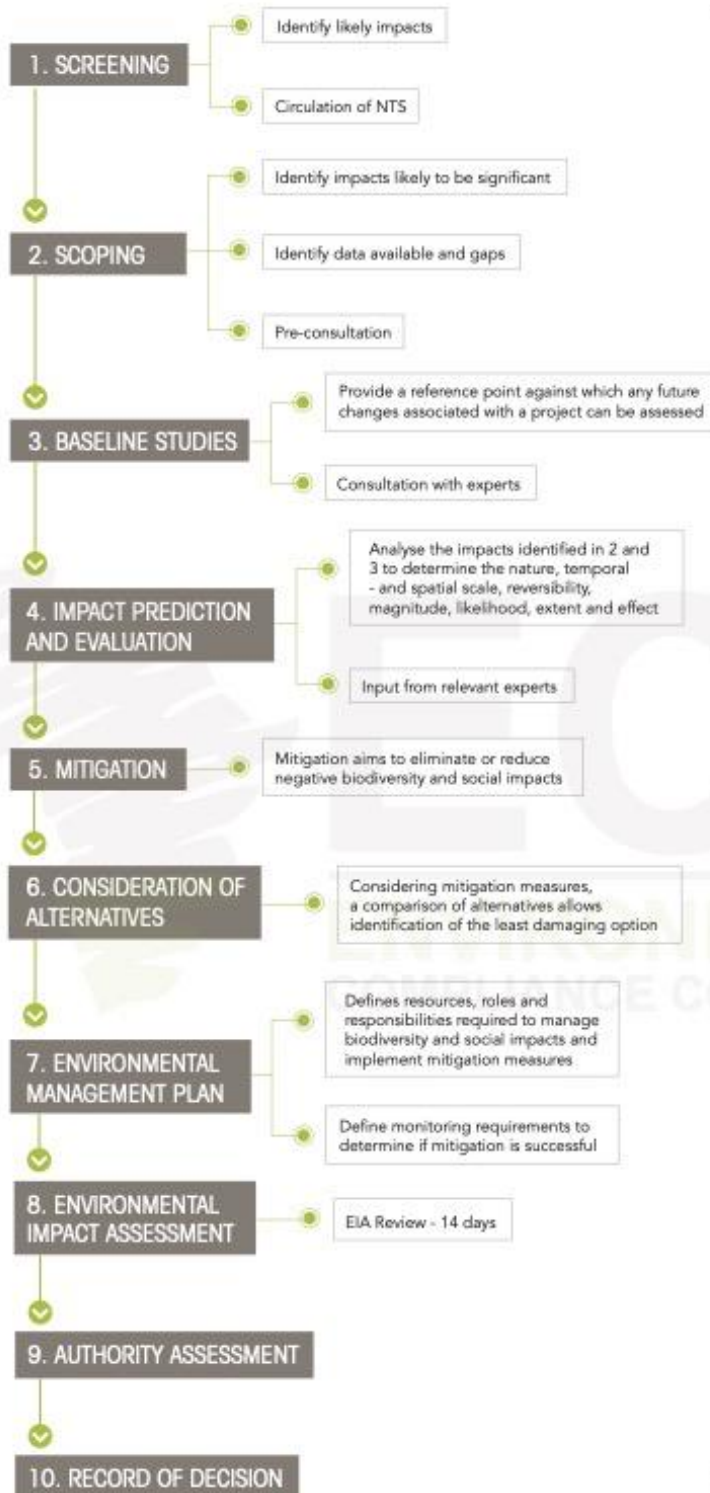
Figure 2 - Flowchart of the environmental and social assessment process