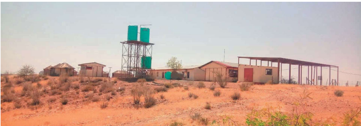
Figure 4: Existing Youth Centre that can be used to accommodate project staff at Kantikoppes settlement

During the field assessment, it was discovered within the EPL (at a small settlement namely Kantikoppes) area is located a Youth Hostel facility / Centre (see Figure 4 ) with adequate supporting infrastructure that could be used as base-camp, thus helping to boost the local. The Facility is connected to national Power grid and local water supplied from several solar and wind-powered boreholes.