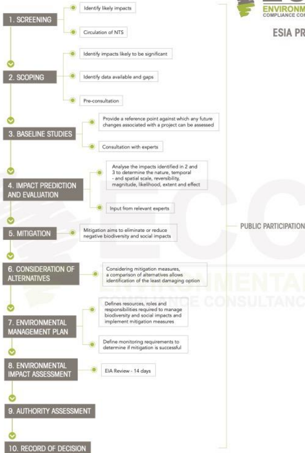
Figure 2 - Flowchart of the environmental and social assessment process