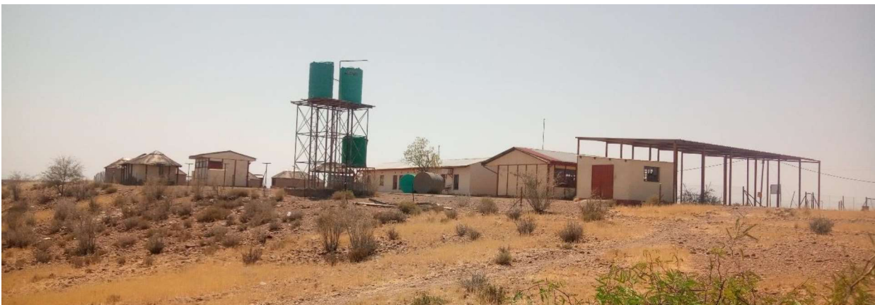
Figure 4: Existing Youth Centre that can be used to accommodate project staff at Kantikoppes settlement

During the field assessment, it was discovered within the EPL (at a small settlement namely Kantikoppes) area is located a Youth Hostel facility / Centre (see Figure 4 ) with adequate supporting infrastructure that could be used as base-camp, thus helping to boost the local. The Facility is connected to national Power grid and local water supplied from several solar and wind-powered boreholes.