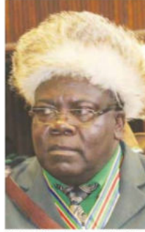
The late Ovambanderu Chief Kilus Nguvauva

customs and will be totally untenable. It will confuse the people and result in unrest in the community.