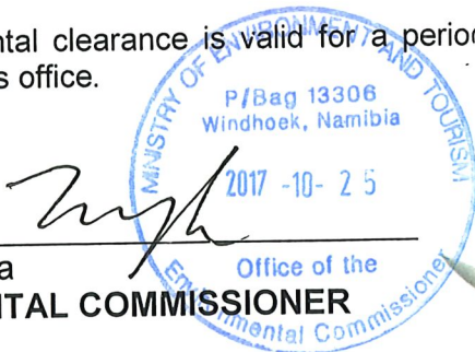
Teofilus Nghitila ENVIRONMENTAL COMMISSIONER