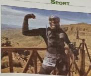
ADRENALINE: from page 24