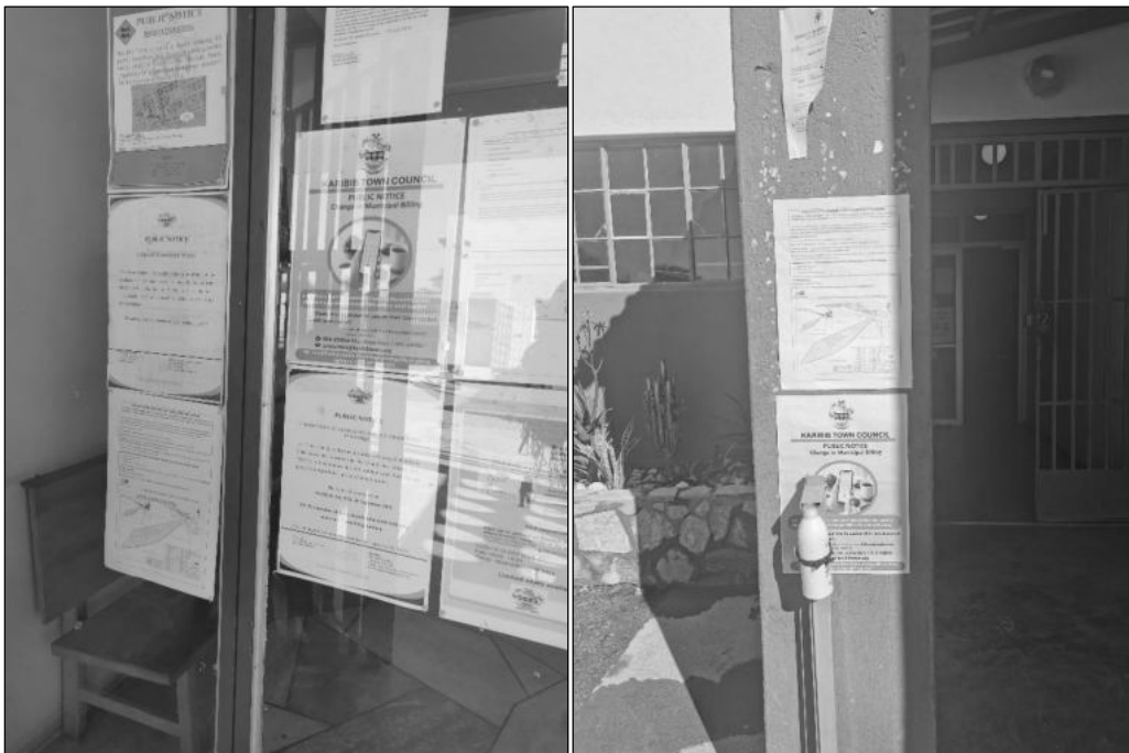
Figure 1: Public notices placed at Karibib Town Council (Main Office) and Usab Community Hall