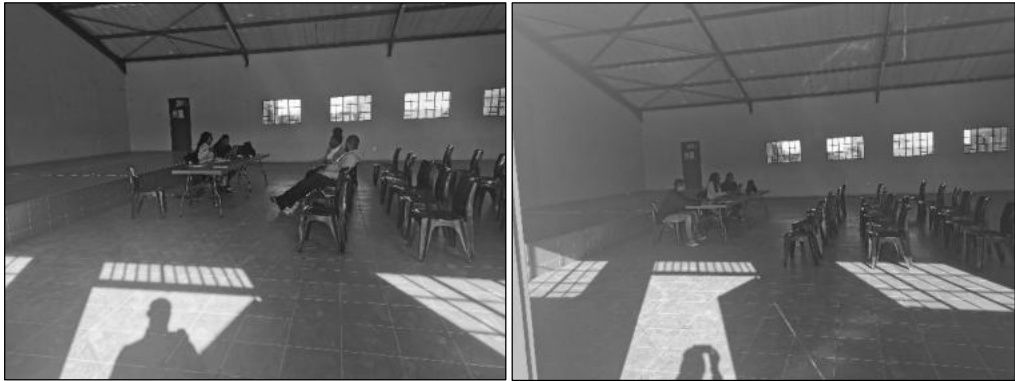
Figure 4: Venue for the consultation meeting on 08 July 2022