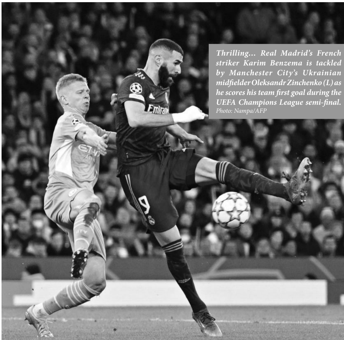
Thrilling... Real Madrid's French striker Karim Benzema is tackled by Manchester City's Ukrainian midfielder Oleksandr Zinchenko (L) as he scores his team first goal during the UEFA Champions League semi-final.