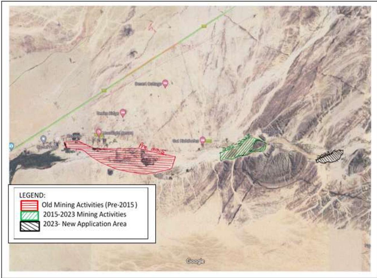
FIGURE 2.1-1: REGIONAL SETTING OF THE SAND MINE / OLD, CURRENT AND PROPOSED NEW AREA OF THE SAND MINING ACT