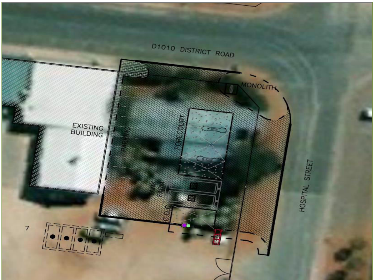
Figure 3. Installation layout