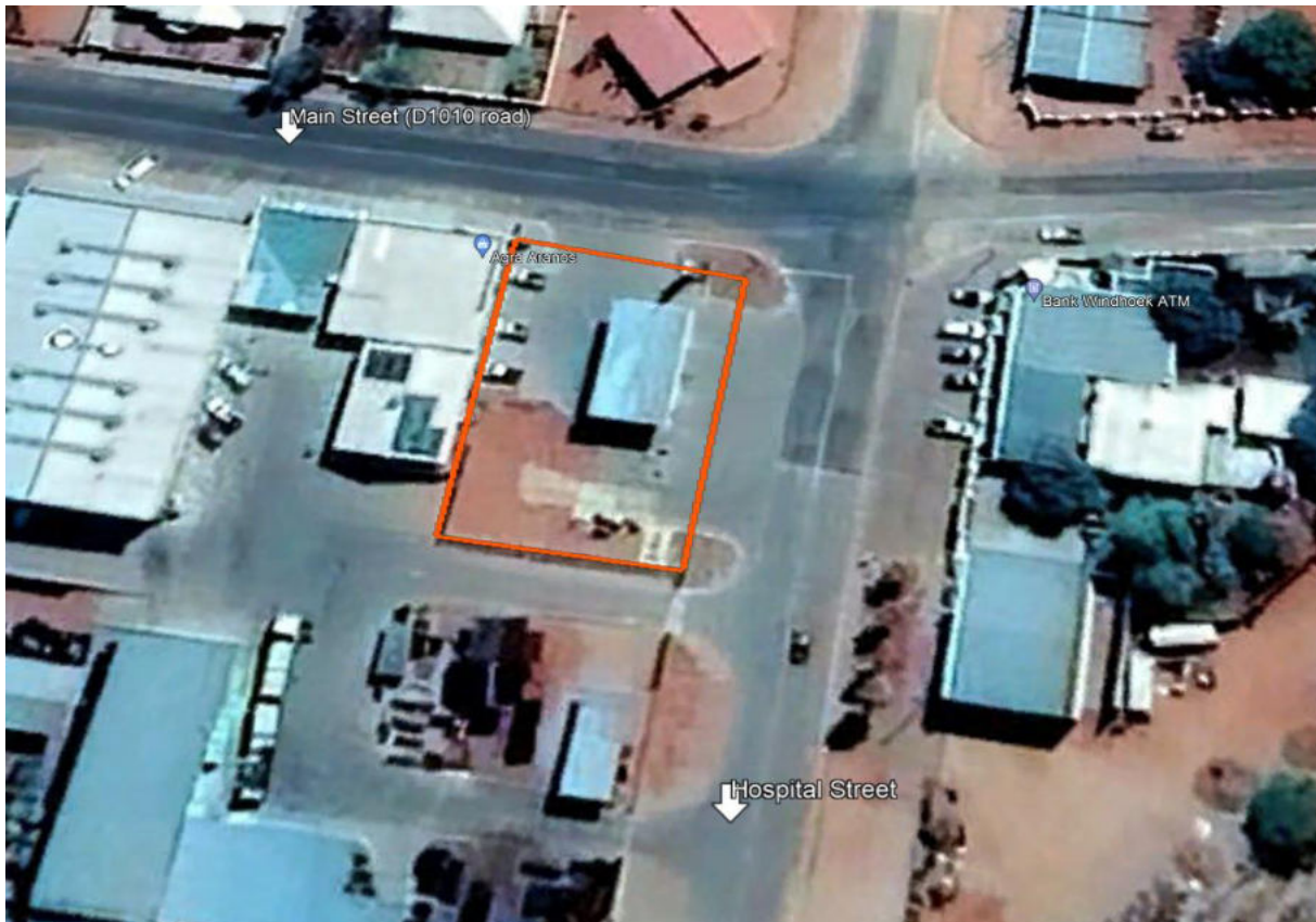
Figure 2. Layout of the site