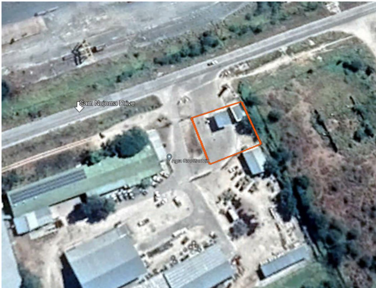
Figure 2. Layout of the site