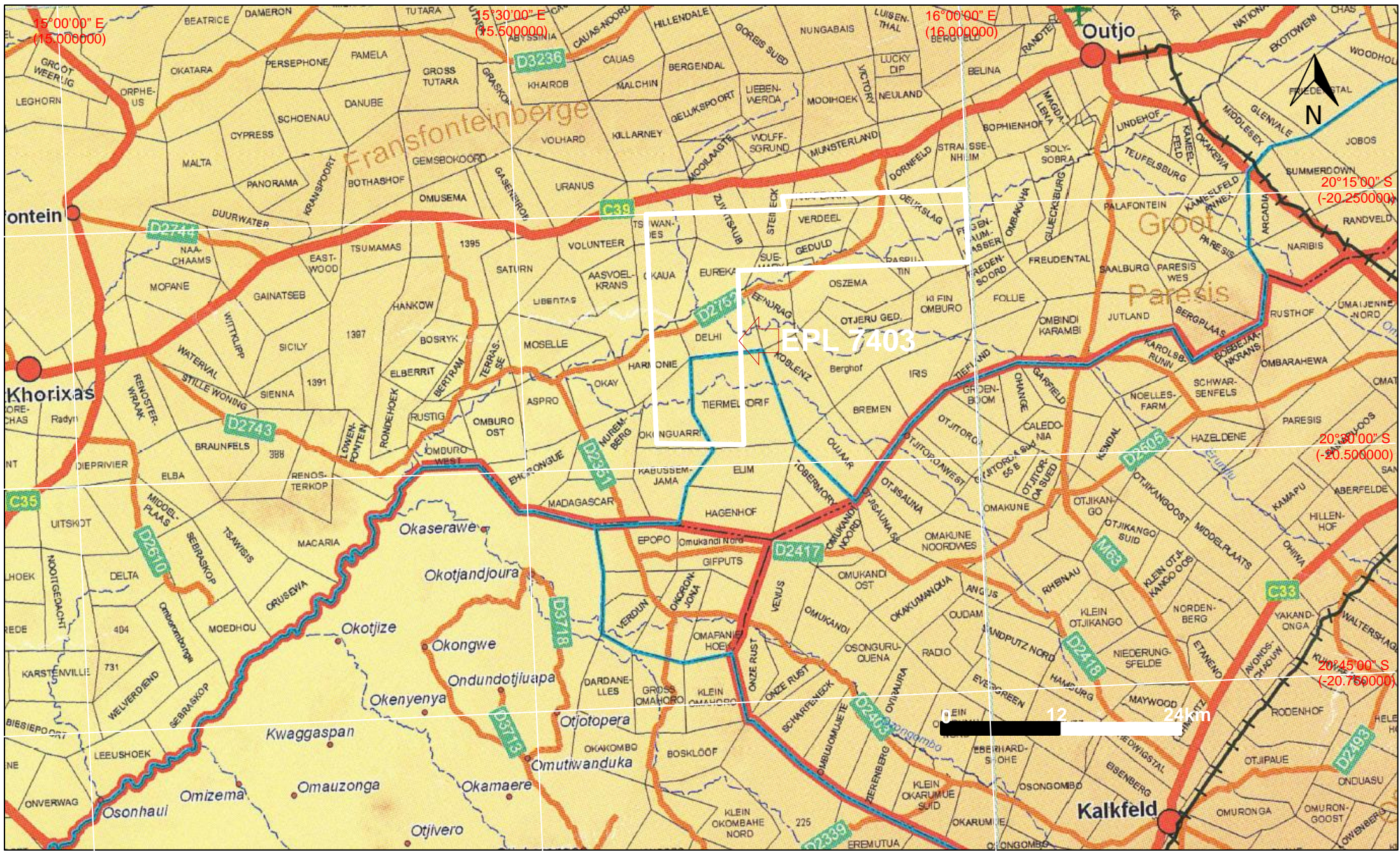
Figure 1.3: Commercial farmland covered by the EPL 7403.