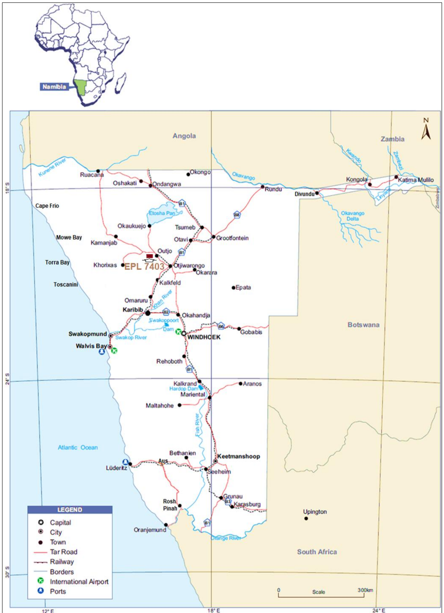
Figure 1.1: Regional location of the EPL No 7403 Area.