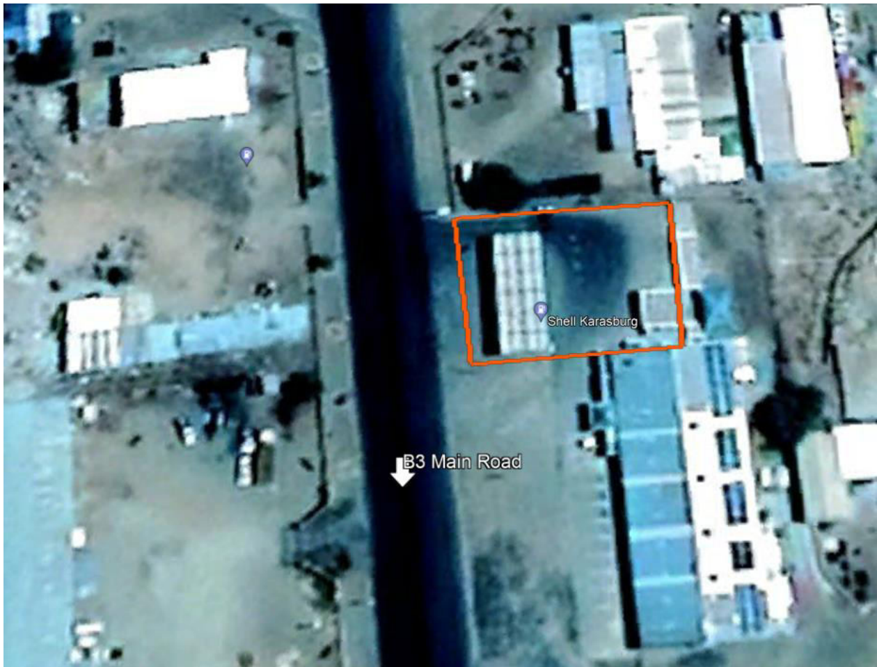
Figure 2. Layout of the site