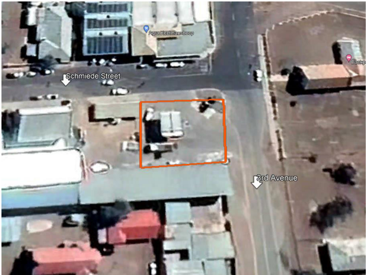
Figure 2. Layout of the site