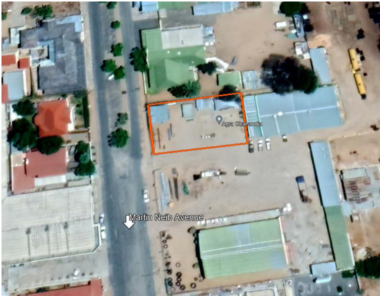
Figure 2. Layout of the site