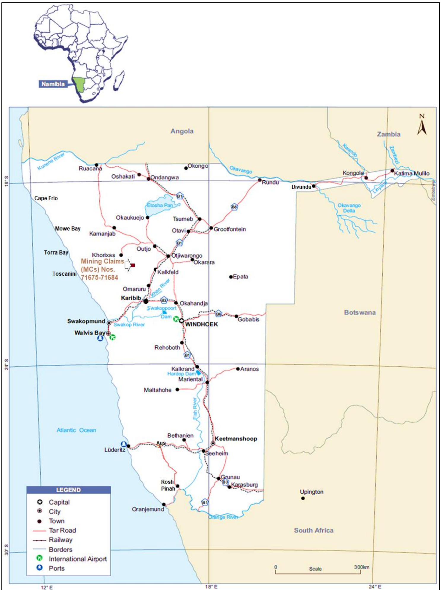
Figure 1.1: Regional location of the MCs 71675-71684 Area.