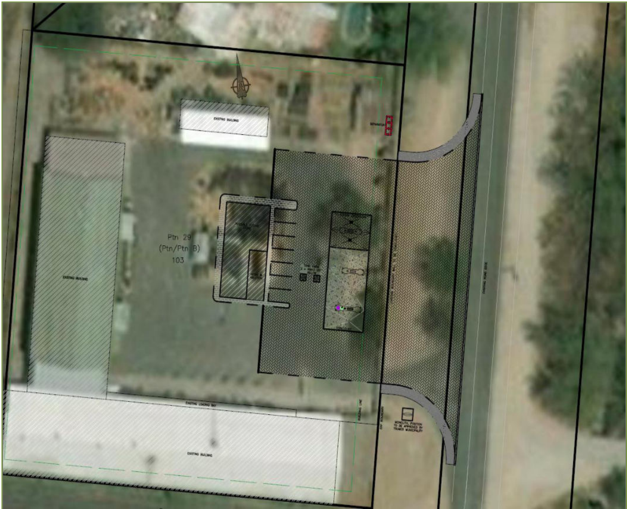
Figure 2. Layout of the site