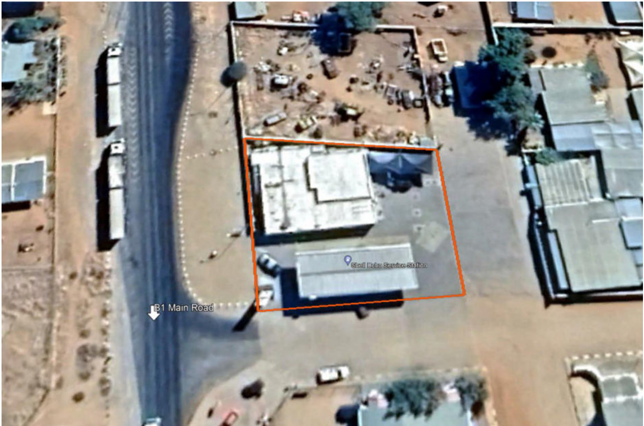
Figure 2. Layout of the site

Directly north of the site is an open storage yard. East of the site is Echo Self Help grocery store, followed by residential properties. South of the site is Echo Bottle Store, followed by more residential properties. West of the site is the B1 road, followed by residences.