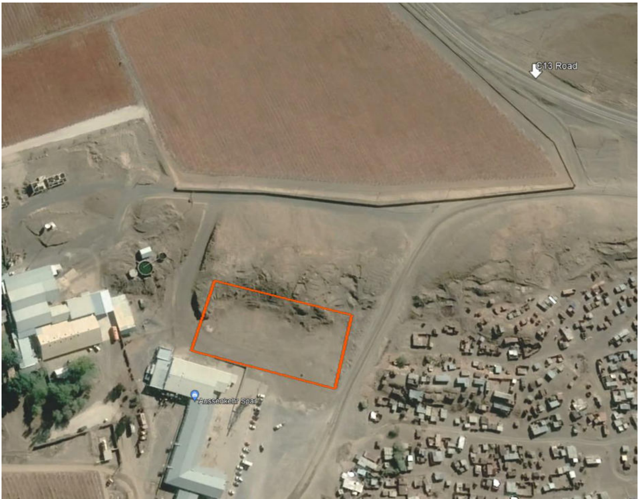
Figure 2. Layout of the site