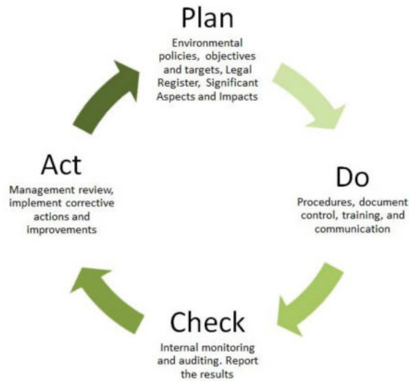
Figure 1: EMP Process

Erongo Regional Council is a sub-national government that is committed to deliver quality and accessible services for the upliftment of its communities through good governance and sustainable socio-economic development. One of the Council's commitments is to plan and manage the establishment and maintenance of sufficient graveyard spaces within its settlements. The lifespan for the existing graveyard at Okombahe is has come to an end, hence a new graveyard is required. The new proposed graveyard is projected to cater for the settlement for the next 20 to 30 years on a land measuring approximately 3 hectares.