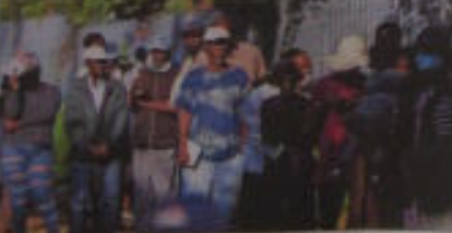
Domestic power outages stand in a person's path in a poor urban area in Johannesburg, a suburb of South Africa.