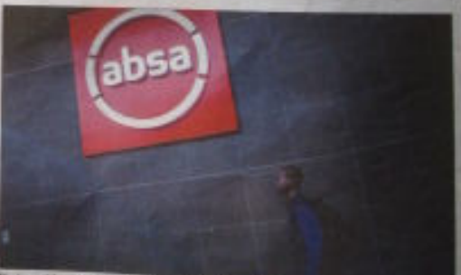
The logo of South Africa's Absa bank is seen outside an Absa branch in Cape Town, South Africa, March 31, 2022.

The group's bad credit card debt rose to R1.2 billion in the first half of 2022, up from R700 million in the first half of 2021. The group's bad credit card debt rose to R1.2 billion in the first half of 2022, up from R700 million in the first half of 2021.