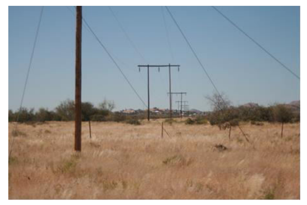
Figure 3. The 66KV Marble-Karibib transmission line with H-Pole structures.

The general Marble-Karibib 66kV transmission line route, have certain anthropomorphic influences mainly associated with roads and tracks, railway line, transmission line and associated access route, infrastructures and urban developments. The impact of common line activities such as inspections and general maintenance activities would be site specific and have a relatively small environmental "footprint" and is not expected to have a major impact on the environment.