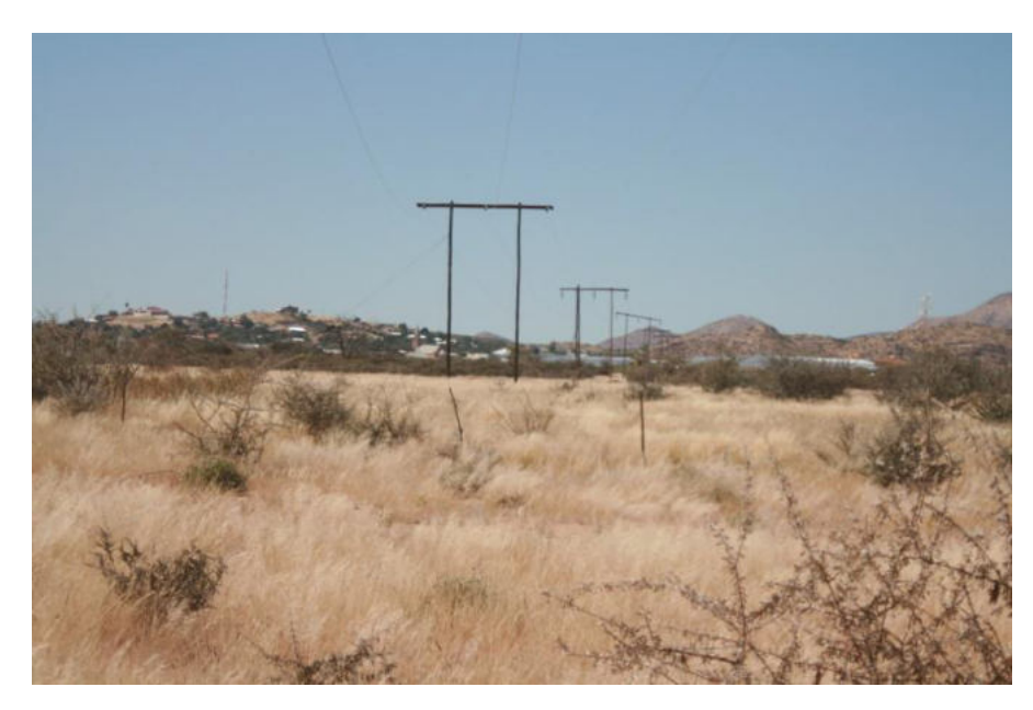
Figure 3. The limestone ridge is viewed as "high" sensitivity – i.e. potentially high biodiversity and thus important habitat.