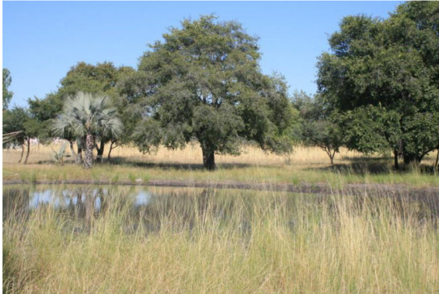
Figure 5. Pans or locally known as oshanas are viewed as the most important habitats along the route.

The route is not heavily vegetated with most of the route beneath the line converted to mahangu fields and or homesteads and other urban developments. The route passes through 8 “hotspot” area which is viewed as “high” sensitivity (See Annexure and Figures 5-6). In terms of sensitivity, 4.7% of the route is viewed as “high” sensitivity i.e. unique habitats and 95.3% of the route is viewed as “low” sensitivity.