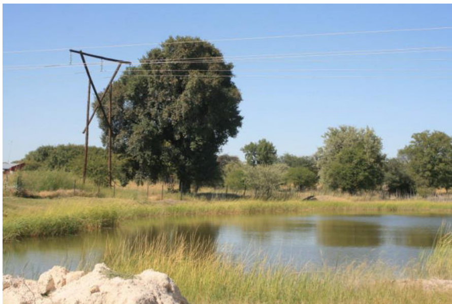
Figure 6. Ephemeral pans along the route are viewed as “high” sensitivity.