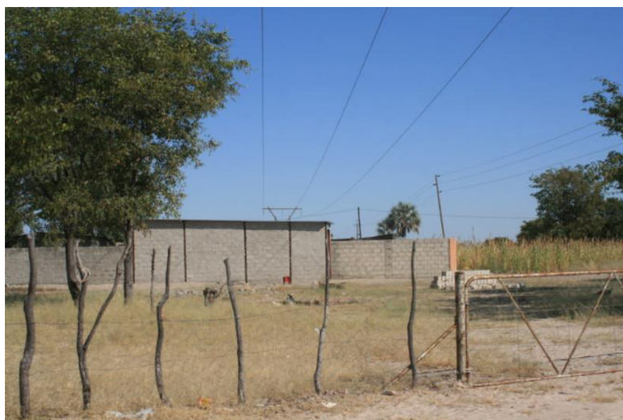
Figure 4. Urban development's beneath some sections of the line.