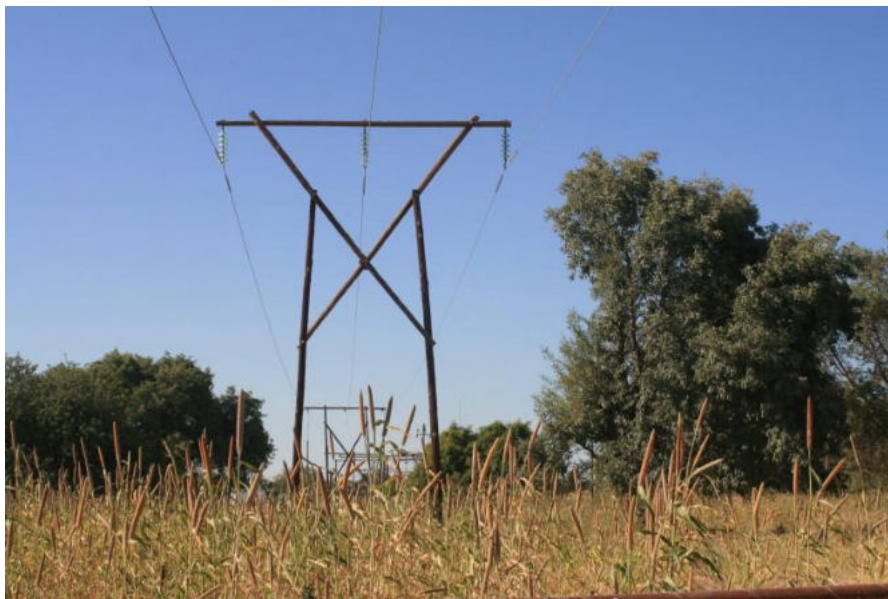
Figure 3. Numerous mahangu fields are located below the line

The Okapya – Oshakati 66kV passes through the vegetation type commonly referred to as Mopane Savannah or the two vegetation types referred to as the Cuvelai Drainage and Western Kalahari. The main rivers draining the general area flow westwards e.g. perennial Kunene River (Ruacana area) and southwards e.g. ephemeral Cuvelai drainage system (Cunningham, 2021). The general Okapya – Oshakati 66kV transmission line route, have numerous anthropogenic influences mainly associated with traditional farming practices (e.g. mahangu fields, kraals) rural/urban homesteads and businesses, tracks and roads, transmission lines and associated access routes and infrastructures (Cunningham, 2021).