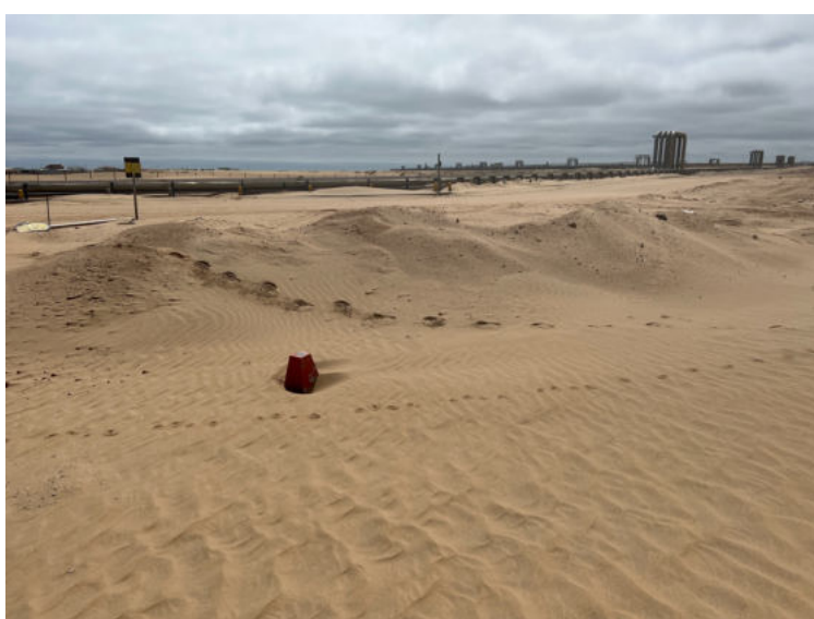
Figure 3: Project area- Proof of development an existing structures around the site