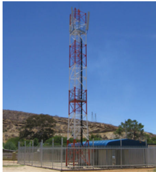
Figure 5: Typical telecommunication towers structure and form (visual puproposes only)