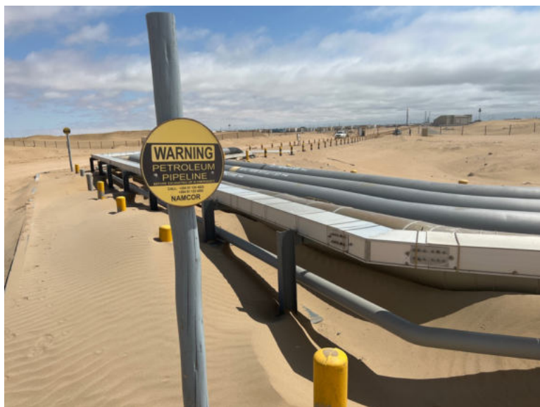
Figure 4: The existing large infrastructure pipeline in proximity to the site.