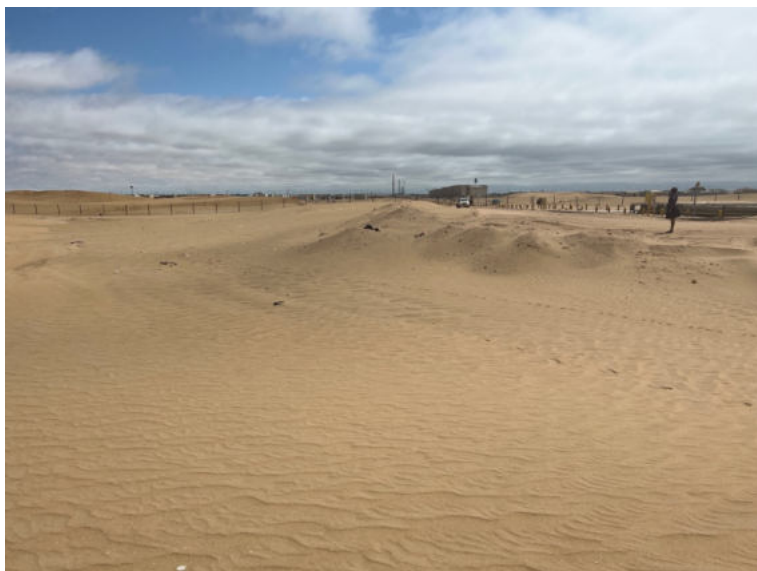
Figure 2: Project Site - Open desert area