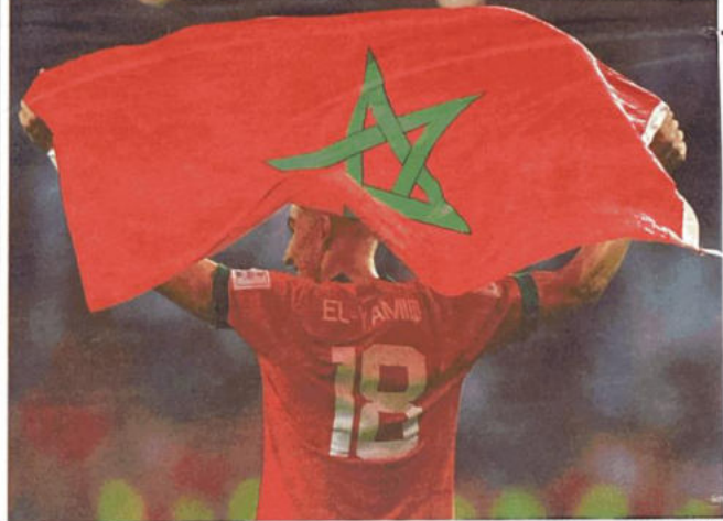
WAVIN' FLAG! ... Morocco are aiming to become the first team from Africa to reach a Fifa World Cup final.

Zikomo Power Energy (Pty) Ltd CLAO220006632