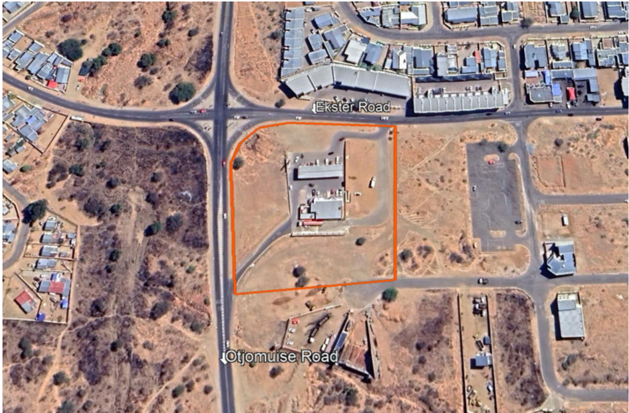
Figure 2. Layout of the site

North of the site is Ekster Street, followed by the Khomasdal Showroom light industrial park, which comprise of Green Zone Gym, Lumbers City and other commercial outlets. East of the site is undeveloped land (open land), followed by a Parking lot. Directly south of the site is undeveloped land. Directly west of the site is the Otjomuise road, followed by undeveloped land, which in turn is followed by residential properties approximately 150m from site.