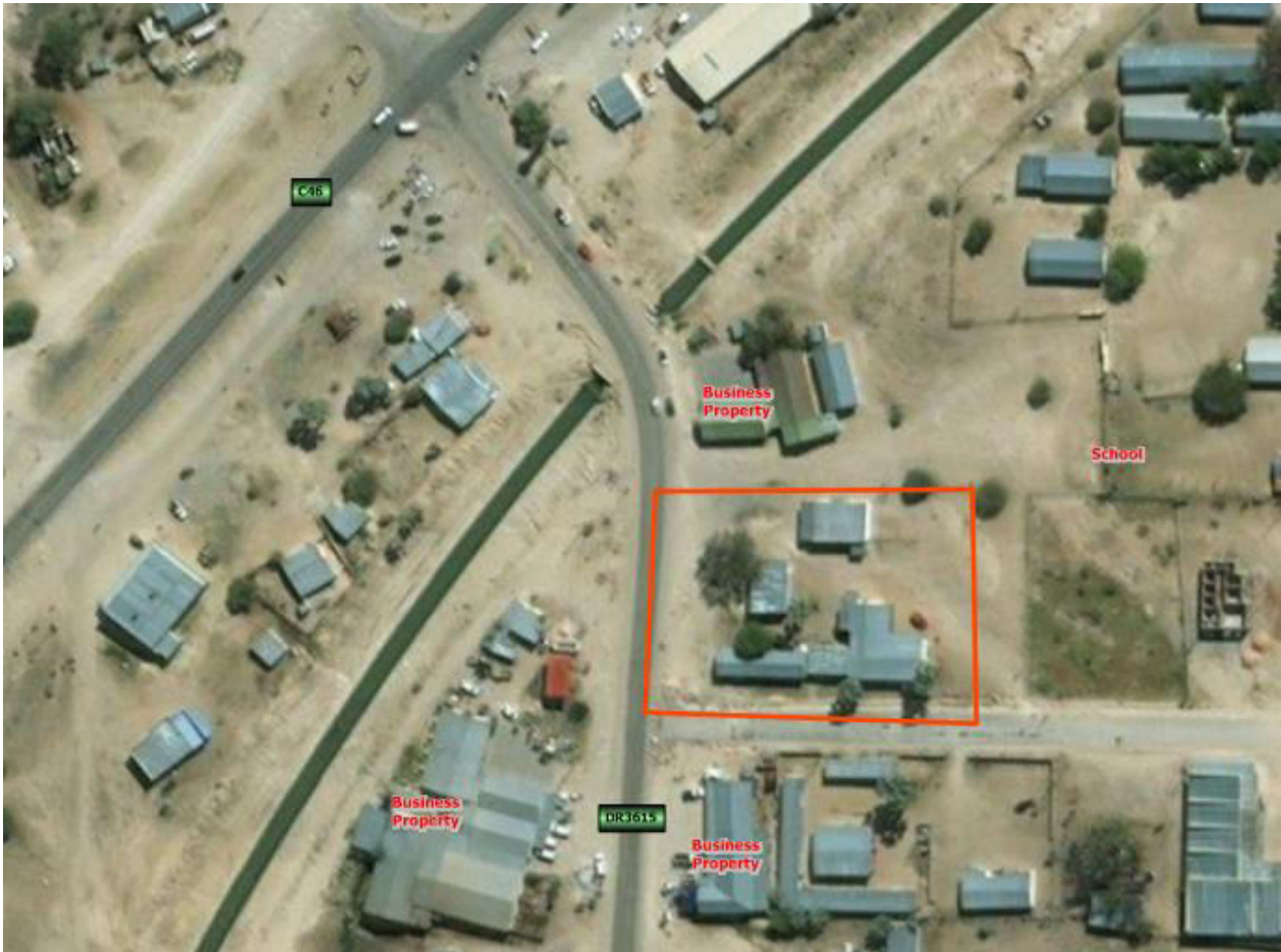
Figure 2. Layout of the site

Directly north of the site is a complex of shops e.g. Amig Restaurant. Mupewa Combined School is situated east of the site. South of the site is Tia Monika Entertainment. West of the site is a complex of shops (e.g. First Choice Boutique, Omusati Printing Shop etc). The fuel retail facility occupies an approximate land size of 5,000m 2 .